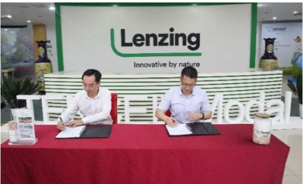
© Lenzing (Nanjing) Fibers Co., Ltd.