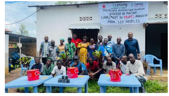
© Caritas Oberösterreich – Internationale Hilfe